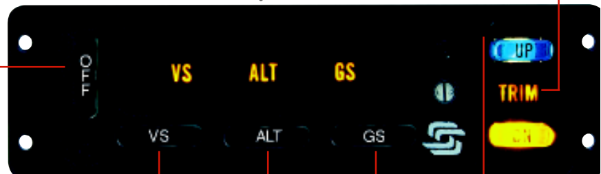
System 60 PSS

Off Switch to disable autopilot (A/P activated by pressing VS or ALT functions).